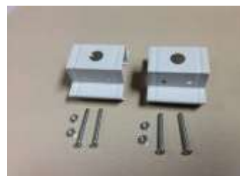
Suspended Mounting Kit