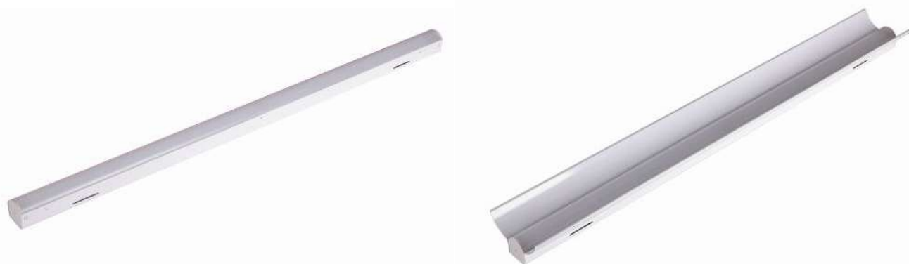
Optional Reflector shown

Manufacturing, Education, Warehouse, Car park, Supermarket, etc.