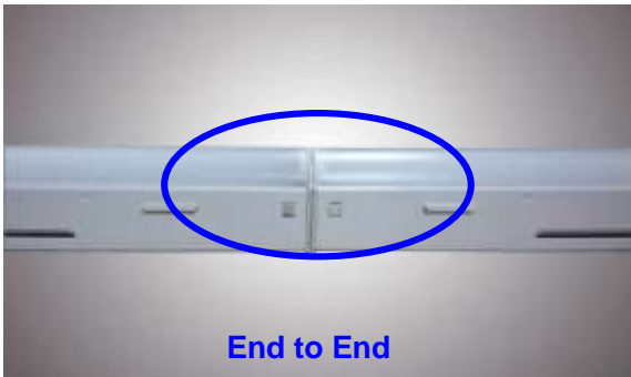
End to End Connection