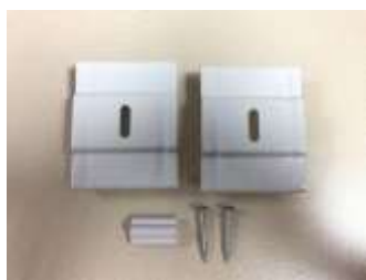
Surface Mounted Clips (included)