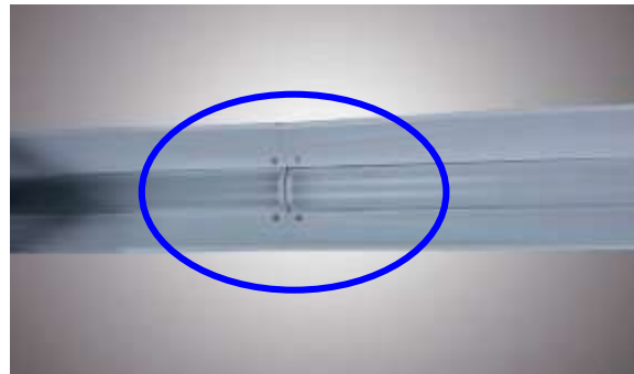
Connected via Reflector Joiner