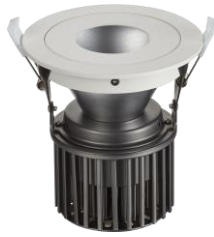
Round hole, Fixed