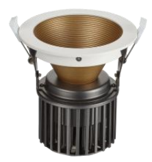
Step-in, Fixed, Golden