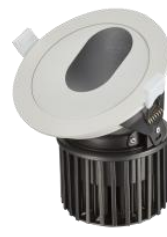
Oval hole, Adjustable